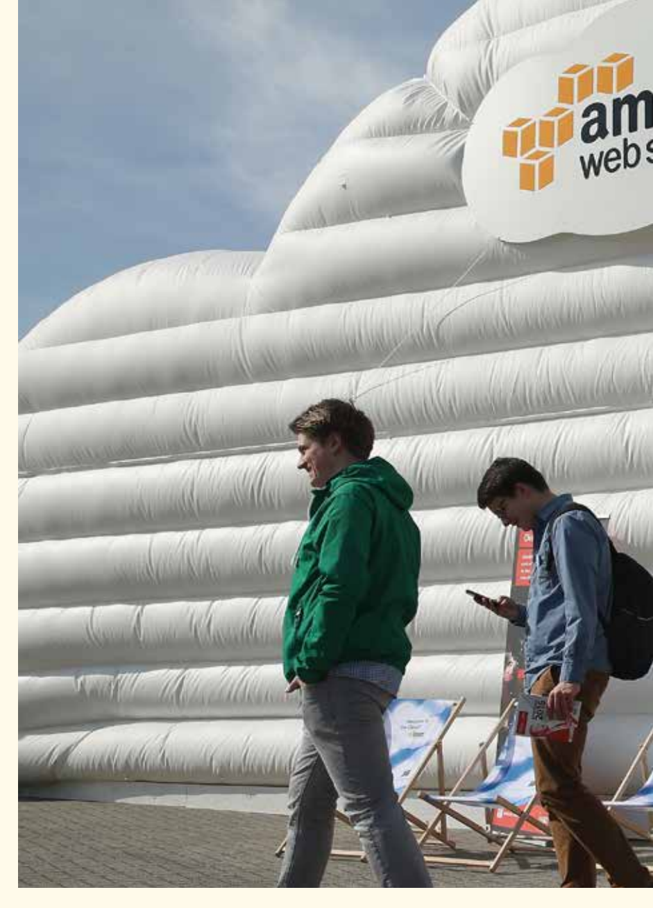
CeBIT 2016 Digital Technology Trade Fair.

We believe that some of the best examples of companies with distinctive cultures are those which are run by their founders. It is no surprise to us that almost all the examples of extreme wealth generation over the last couple of decades have come from founder-run companies. Founder managers possess many of the attributes described in previous paragraphs. Naturally they take the long-term view because their companies reflect the culmination of their life's work. They have an attachment to the business, rather than the stock price, and their aim from the outset is to build something meaningful and significant. They also typically have significant skin in the game, and as founders of the business