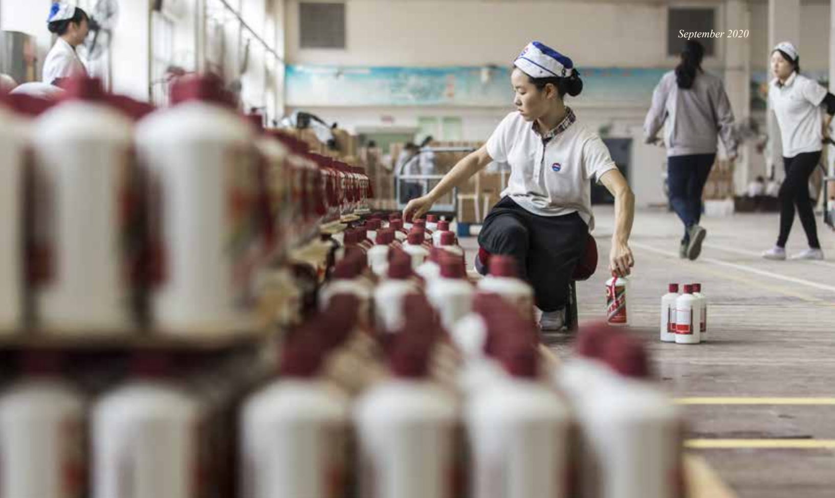
Baijiu Production Inside China's Biggest Distiller Kweichow Moutai Co.