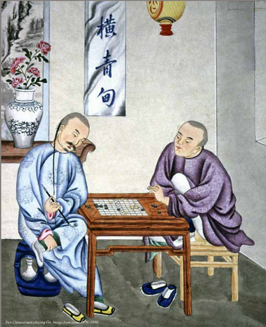
Two Chinese men playing Go. Image from circa 1870–1890.

You can't win at go with a chess mindset