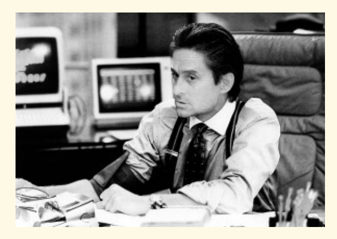
Michael Douglas in the Film 'Wall Street'.